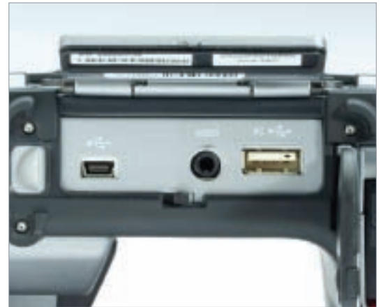
From Left to right: USB mini for PC image download, NTSC video, USB-A for memory stick image transfer