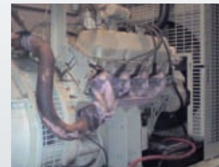
Visual Image of Generator

FLIR's new FUSION functionality allows for easier identification and interpretation of infrared images. This advanced technology enhances the value of an infrared image by allowing you to overlay it directly over the corresponding visible image. This functionality combines the benefits of both the infrared image and visual picture at the push of a button. The T360 camera does this in real-time and the overlay function can be easily adjusted to suit any application such as electrical surveys, building diagnostics, and mechanical inspections.