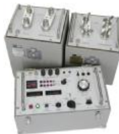
PCU1/E, LU500 and LU3000

Where higher currents and powers are required for primary injection, 7kVA and 20kVA primary injection systems are available. The PCU1/E and PCU2/E systems have separate control and loading units, allowing a wide range of load conditions to be covered with different loading units.